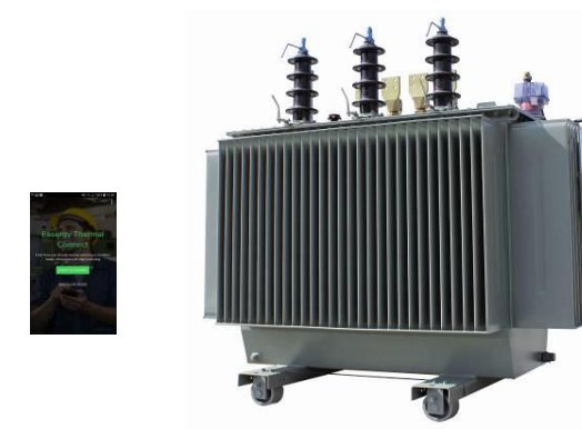
Nearby Condition Monitoring Thermal monitoring (resistive effect)