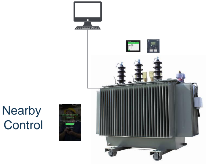
Connected Condition Monitoring

Thermal monitoring Environmental monitoring Oil level, oil t°, oil pressure Analytics (aging and hotspot)